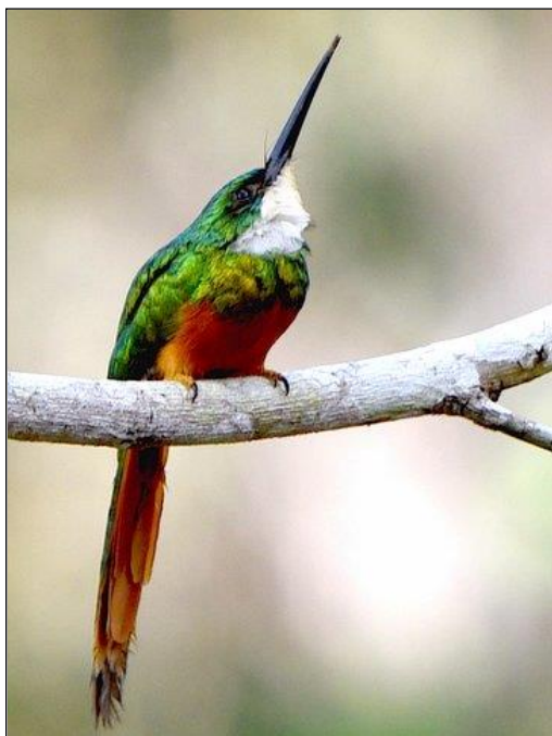
Rufous-tailed Jacamar

After an early lunch, the rain eased and so at 14.30 we headed up onto the Extension Trail, where we spent the rest of the afternoon. Other highlights from today included our first views of Slaty-breasted Wood Rail, Saw-billed Hermit, Swallow-tailed Hummingbird, Versicoloured Emerald, Brazilian Ruby, Blond-crested Woodpecker (which turned up almost daily on the lodge feeders), Maroon-bellied and Plain Parakeets, Band-tailed Hornero (a rare visitor to the lodge grounds), Pale-browed Treehunter, White-throated Woodcreeper, fantastic views of 2 Star-throated Antwrens, the first of our set of 6 Drymophila antbirds, the Scaled Antbird, Gray-capped Tyrannulet, Yellow-lored Tody-Flycatcher, and nice views of 2 Gray-hooded Attilas. A fantastic male Pin-tailed Manakin put on a great show, followed by 4 Blue Manakins, and Red-necked and Yellow-backed Tanagers. We also had great views of White-tufted Eared Marmosets on the feeders.