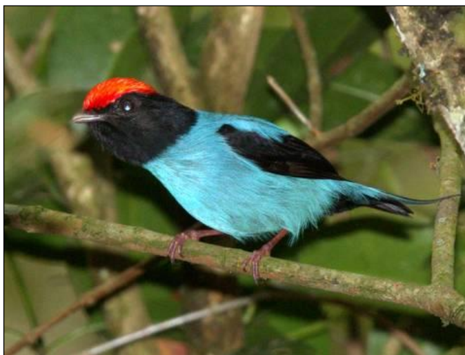
Blue Manakin by Adam Riley

Waking up the next morning, the previous day's rain was now a distant memory, so we decided to head up onto the track to Macae de Cima at an altitude of between 1000–1450m. We began our mid-level birding with the potential for a lot of new and different species. Although a bit chilly and with little bird activity first thing in the morning, it soon started to warm up and we began seeing some great birds! Highlights included Black Hawk-Eagle, brief but good views of a single Mantled Hawk that Richard picked up drifting overhead, a very well behaved Scale-throated Hermit that performed well to playback and gave us all a good show, Frilled Coquette (a difficult bird at this time