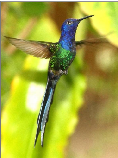
Swallow-tailed Hummingbird by Markus Lilje

we scanned for a further 40 minutes and finally ... YES ... there it was! We quickly put the scope on it, and the group had quick looks ... and then came back for seconds ... and thirds ... and even fourths! The bird ended up staying on the same perch for over 15 minutes!! We also had views of Black-and-gold Cotingas and Bay-chested Warbling Finches during the day. We continued on down to the minibus and took a short drive to another spot, where we had good views of nesting Swallow-tailed Cotingas with chicks, Hooded Siskin and 3 Red-legged Seriemas.