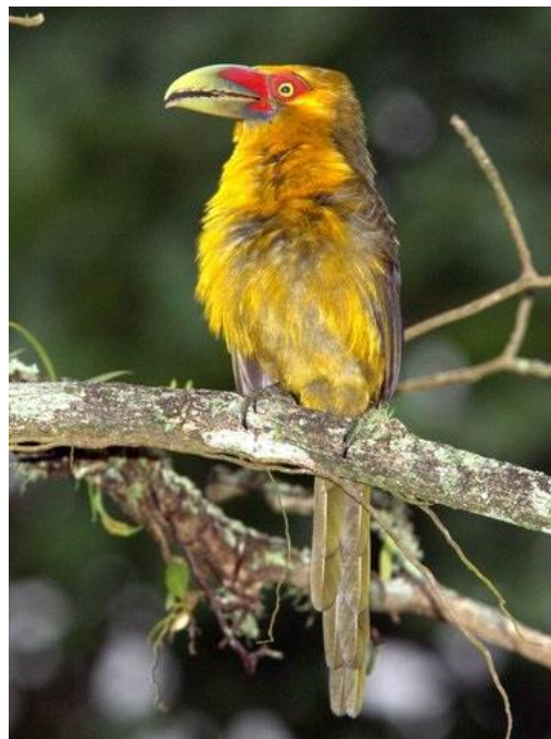
Saffron Toucanet

The following day was Three-toed Jacamar day! After just over an hour's drive we arrived at our first stop on this great open country birding expedition, with our main target being the range restricted and endemic Three-toed Jacamar. We managed to see a total of 96 species during the day! Highlights included no less than 5 Three-toed Jacamars (!), Lesser Yellow-headed Vulture, White-tailed Hawk, Blackish Rail, Guira Cuckoo, Planalto Hermit, Swallow-tailed Hummingbird, Glittering-bellied and Sapphire-spangled Emeralds, Aplomado Falcon, 6 Blue-winged Macaws, Yellow-chinned Spinetails (showing their yellow chins!), Firewood-gatherer, Rufous-capped Antshrike, great views of Serra Antwren, 2 Crested Black Tyrants, Streamer-tailed Tyrant (which put on a good show after taking a little while to find), Green-backed Becard, Tawny-headed and several White-rumped Swallows, Masked Yellowthroat, White-browed Blackbird, Grassland Sparrow, stunning Gilt-edged Tanagers (a firm favourite with the group!) and White-bellied Seedeater.