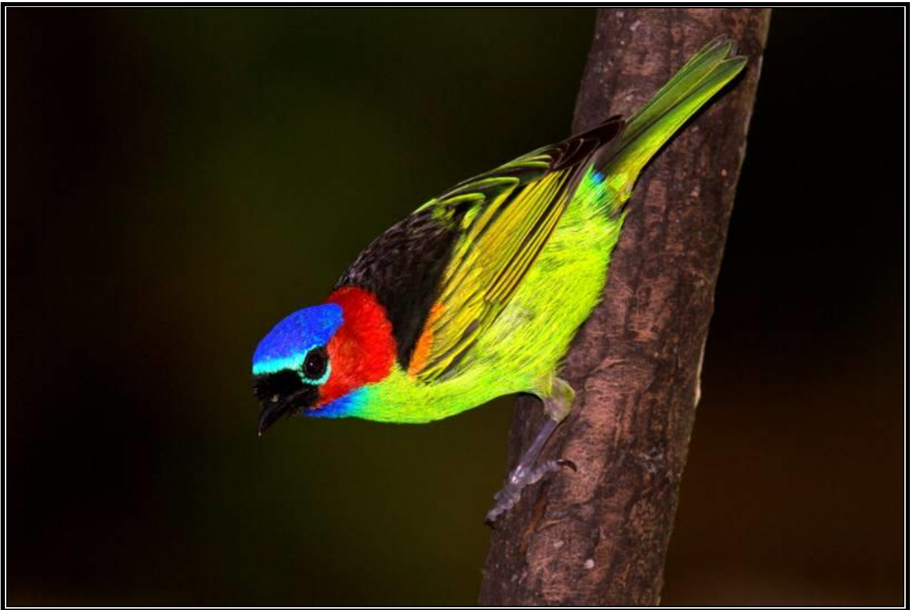
Red-necked Tanager