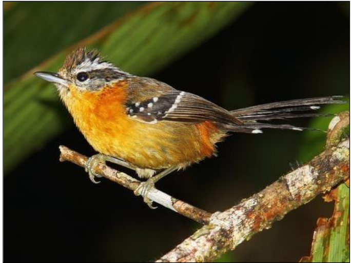
Bertoni's Antbird

Thankfully, on step 131 (approximately!) we managed to see a single bird, which eventually showed very well! Content in having seen this bird without having to go all the way to the top, we turned around and started heading back down to have lunch on a grassy area where we would be able to scan for Grey-winged Cotinga... and did we do some scanning! But, once again, without success.... We then carried on down, obtaining more views of Diademed Tanagers before reaching the final area where we still had a chance of seeing the Grey-winged Cotinga, since it doesn't exist below this point. After some playback we eventually got a response: it was close, but not visible, so