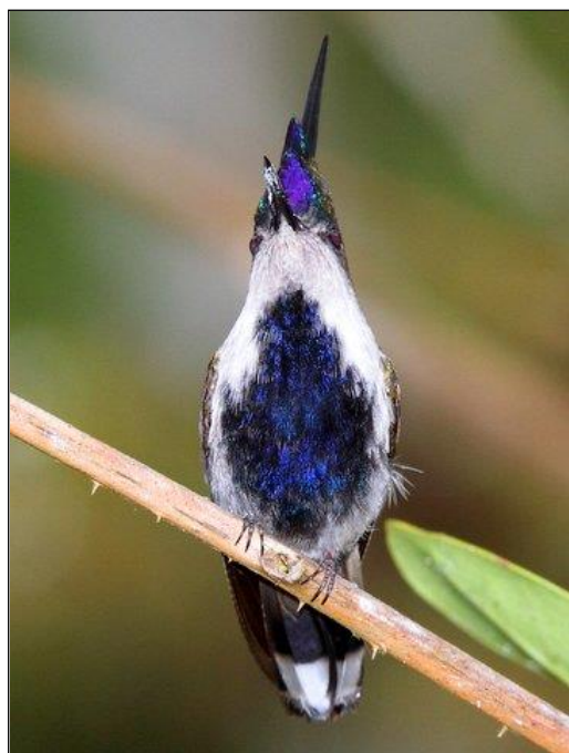
Plovercrest

of year), White-throated Hummingbird, Amethyst Woodstar, Surucua Trogon, Yellow-browed Woodpecker, Chicli and Pallid Spinetails, Orange-eyed Thornbird, White-collared Foliage-gleaner, both Ochre-rumped and Dusky-tailed Antbirds, which gave good views to the whole group, and after some effort, the White-bibbed Antbird finally put in an appearance as well. We also had excellent views of 2 Shear-tailed Grey Tyrants, 5 Bare-throated Bellbirds, which put on a great display with their continuous “clanging” throughout the day, Serra do Mar Tyrant-Manakin, White-necked Thrush, many Crested Oropendolas in their nesting tree, and Green-winged Saltator.