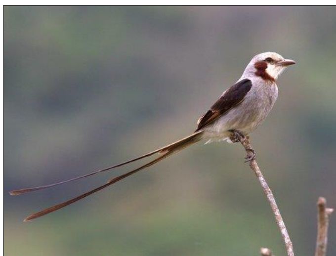
Streamer-tailed Tyrant by Adam Riley

Waking up on our last full day, we set off for a morning trip to bird the trail at the Portao Azul (blue gate). Upon arrival, it started to rain quite heavily ... though thankfully it soon stopped and by the end of the morning the sun was shining! As we were now nearing the end of our trip there were not as many target species still remaining; however, we still had a few key species that we needed to pick up. Highlights of the morning included Dusky-legged Guan, Grey-headed and Plumbeous Kites, Planalto Hermit, Glittering-bellied Emerald, Saffron Toucanet, Buff-browed Foliage-gleaner, Grey-hooded Flycatcher, Drab-breasted Bamboo Tyrant, Swainson's Flycatcher and, after a lot of effort, we managed to finally locate the elusive Half-collared Sparrow ... only to then find one out in the open, which gave seriously good upgraded views for the group! We also had good views of the beautiful Magpie Tanager, Gilt-edged Tanager, Uniform Finch and Green-winged Saltator.